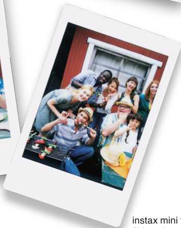
instax mini film (86 x 54 mm)