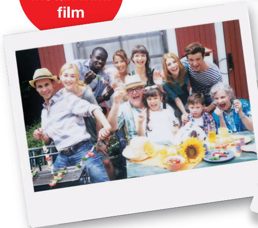
instax WIDE film (86 x 108 mm)